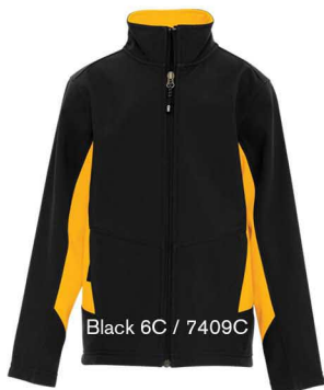
Black 6C / 7409C