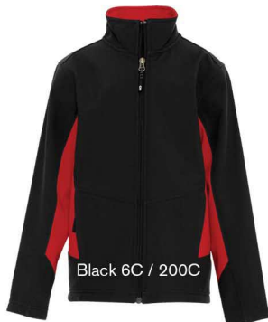
Black 6C / 200C