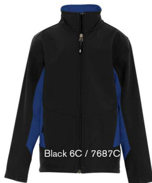
Black 6C / 7687C

Due to the nature of polyester, special care must be taken throughout the decoration process.